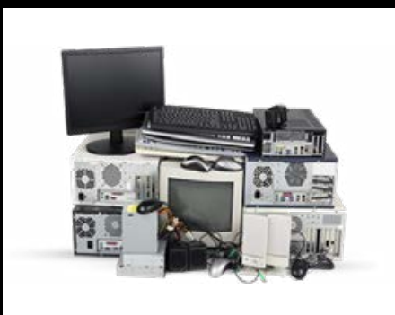
Computers and Accessories* Officeworks (Mildura)