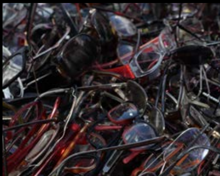
Prescription Glasses Lions Club of Red Cliffs Drop off at the RCCRC