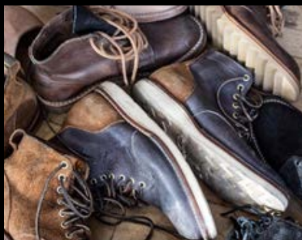
Boots Totally Workwear (Mildura)