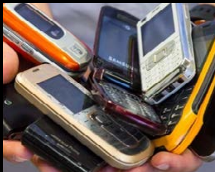
Mobile Phones Officeworks (Mildura)