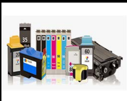
Printer Cartridges Officeworks (Mildura)