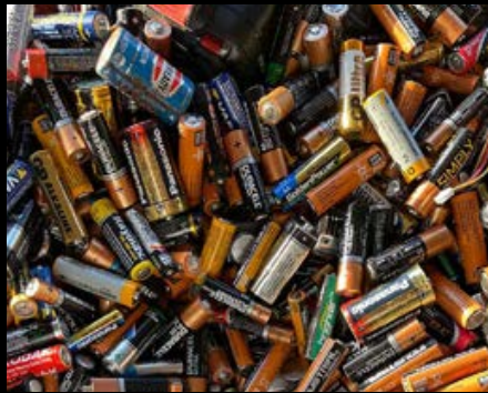
Small Batteries Red Cliffs Library, Foodworks, Richie's IGA.