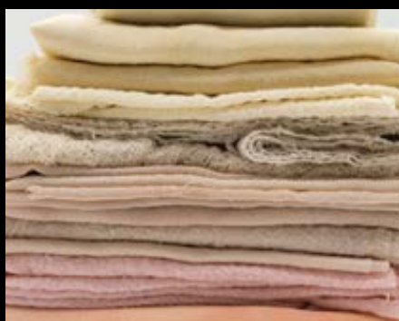
Old Towels and Linens Benetook Veterinary Clinic

Other recycling places. AS & CO accept a wide range of items for recycling - Check out their list on their website