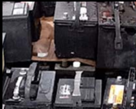
Car Batteries Battery World (Mildura)