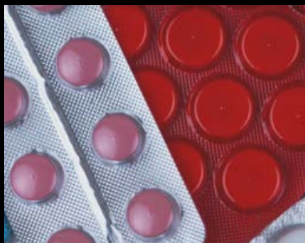
Blister Packs Red Cliffs Community Resource Centre