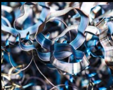
Metal Scraps Simmons Scrap Metal recyclers