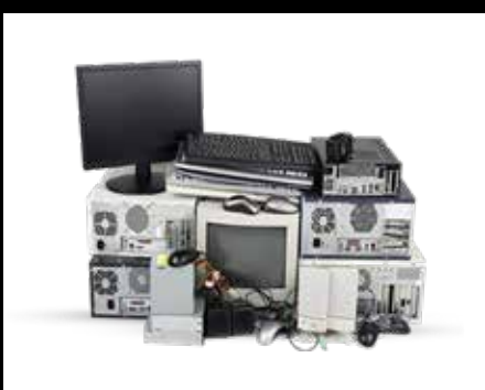
Computers and Accessories* Officeworks (Mildura)