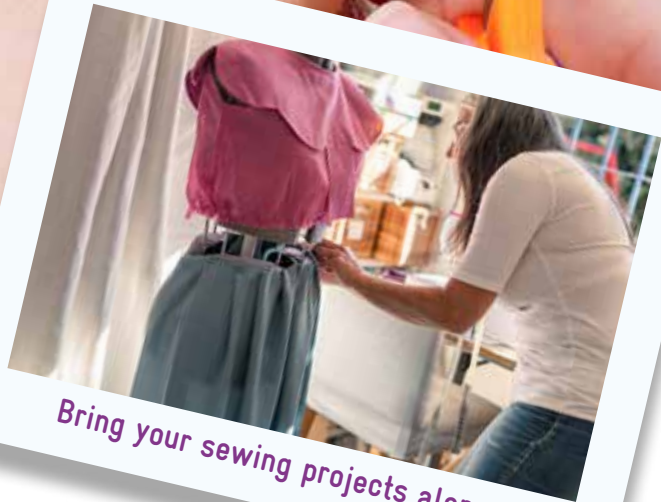
Bring your sewing projects along.