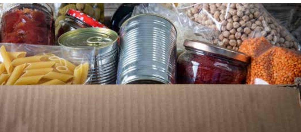
Above: Fresh apples donated Below: Food hampers are available to Red Cliffs residents.

or email: rcresource.reception@gmail.com.au