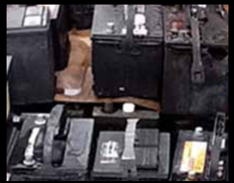
Car Batteries Battery World (Mildura)