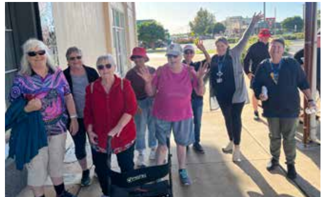
Wednesday walking group. Leaving at 8:30am sharp on Wednesdays.