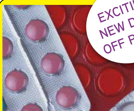
Blister Packs Red Cliffs Community Resource Centre