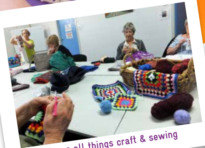
Discuss all things craft & sewing