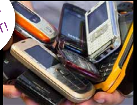
Mobile Phones Officeworks (Mildura)