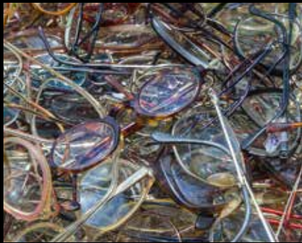
Prescription Glasses Lions Club of Red Cliffs Drop off at the RCCRC