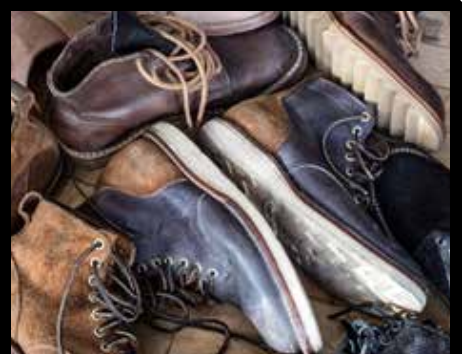
Boots Totally Workwear (Mildura)