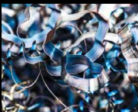
Metal Scraps Simmons Scrap Metal recyclers