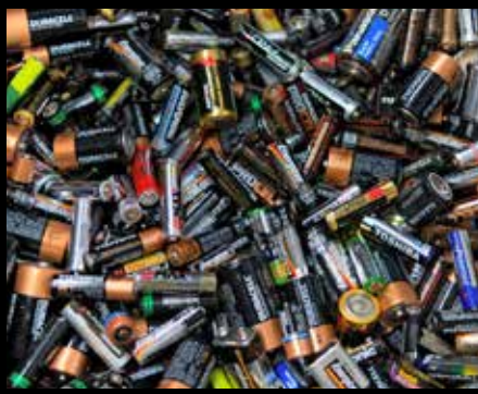
Small Batteries Red Cliffs Library, Foodworks, Richie's IGA.