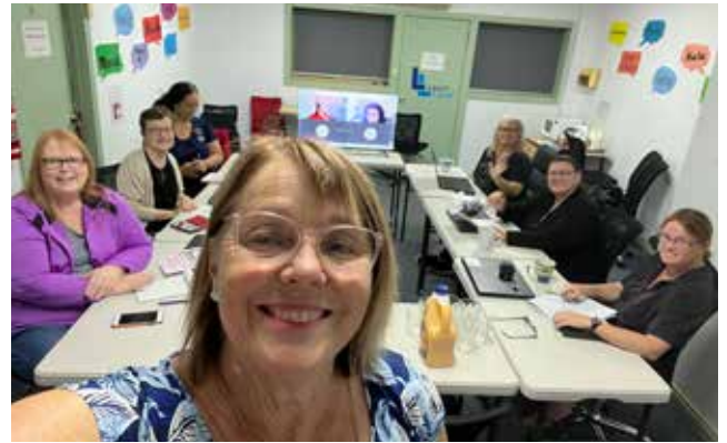
Photo of our digital literacy students on a International Women's Day Zoom about Financial Empowerment.