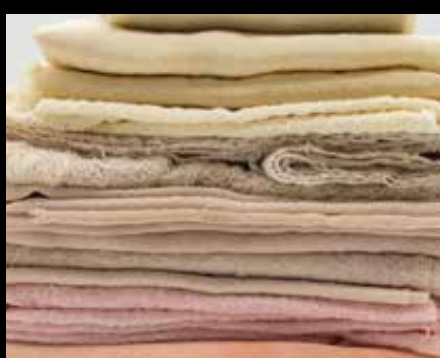
Old Towels and Linens Benetook Veterinary Clinic

Other recycling places. AS & CO accept a wide range of items for recycling - Check out their list on their website