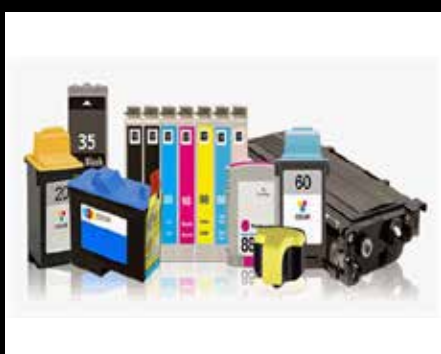
Printer Cartridges Officeworks (Mildura)